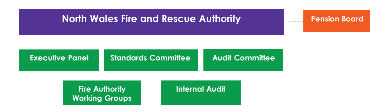
Fig 2. Committees of the Fire and Rescue Authority