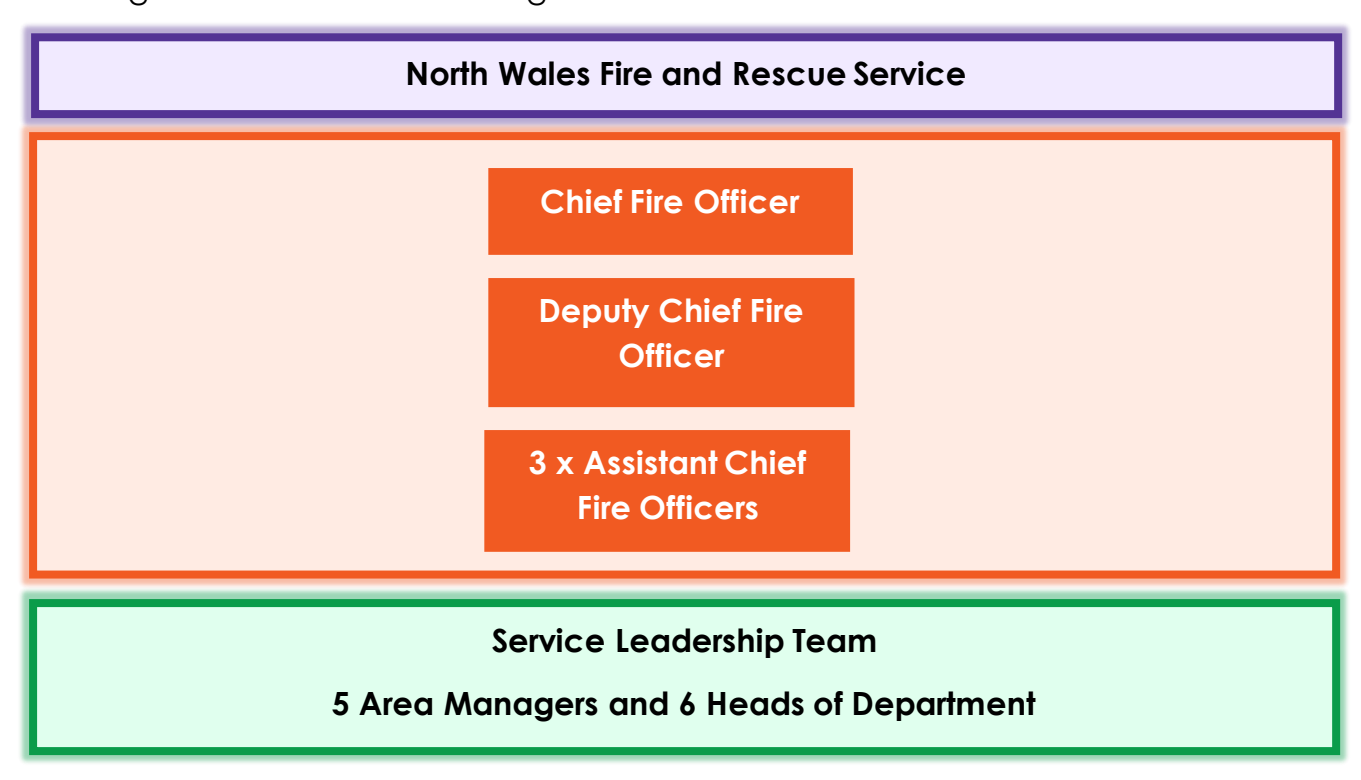
Fig 3. Service Leadership Structure

The Service Governance and Assurance Structure of committees and groups, reporting to SLT, are embedded across the organisation, demonstrating robust governance across reporting, monitoring, scrutiny and decisionmaking within all areas of the organisation.