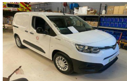
Image: EV Van in workshop

In addition, the Fleet Department, procured four fully electric vans which are currently on trial, across various departments, to test their viability in relation to service requirements.