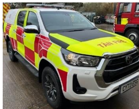
Image: Multi-purpose station vehicle

A total of five replacement towers were scheduled for completion during 2023/24. Of these three will now be completed in the first quarter of 2024/25.