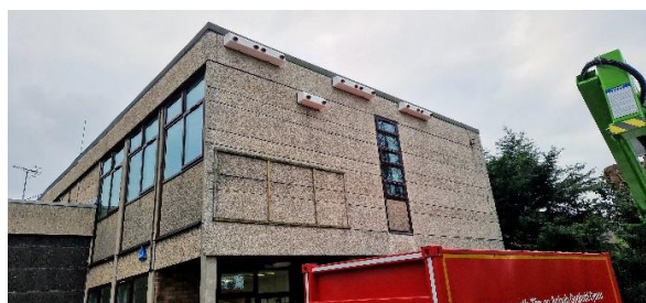
Image: Colwyn Bay Fire Station

Working closely with Welsh Government Energy Service a plan has been developed to decarbonise our heating systems. This will form the basis of a programme of rolling heating system replacements over the coming years, prioritised as funding and operational requirements permit.