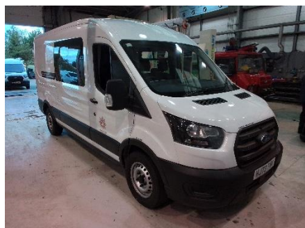
Image: Welfare Unit in the Workshop

Capital expenditure for 2023/24 amounted to £2,182k, details of the various schemes are in the below table.